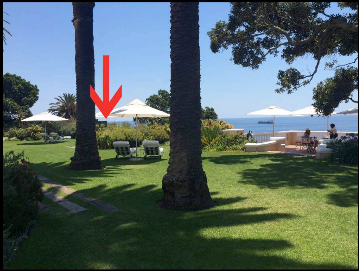
4 - From the gym area